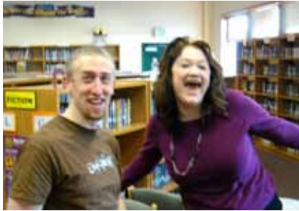
...smarter thinking-better results!