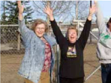
...smarter thinking-better results!