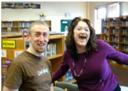
...smarter thinking-better results!