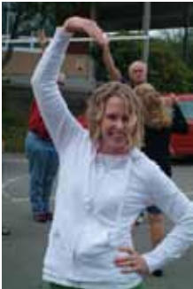
...smarter thinking-better results!